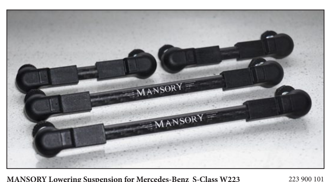
MANSORY Lowering Suspension for Mercedes-Benz S-Class W223 2 level adjusting rods front axle, 2 level adjusting rods rear axle