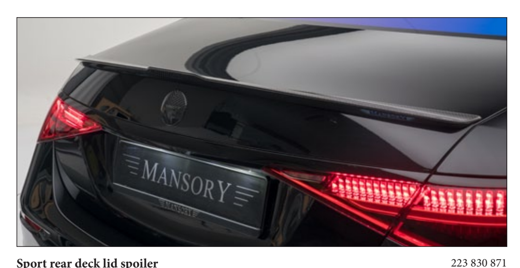
Sport rear deck lid spoiler visible carbon fibre primed without clear coat