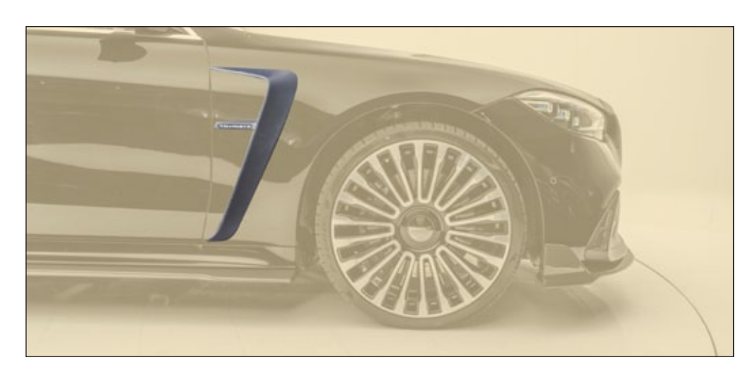
Air outtake for front fender

2 parts set - left & right, with logo visible carbon fibre without clear coat