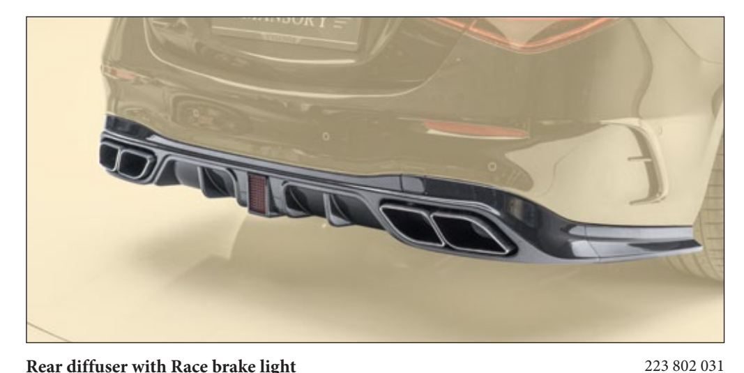
Rear diffuser with Race brake light visible carbon fibre without clear coat, race brake light, exhaust blinds