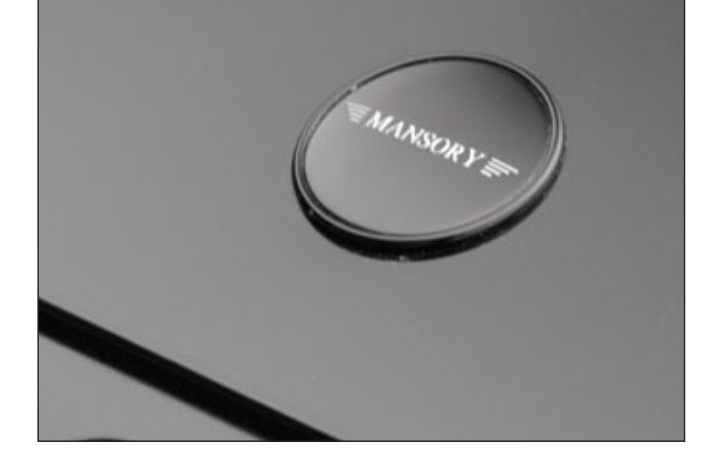
Engine bonnet emblem with logo