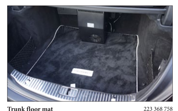
Trunk floor mat with MANSORY logo stitching, color of velour, leather selectable

4 parts set - left & right, with MANSORY logo stitching, color of velour, leather selectable