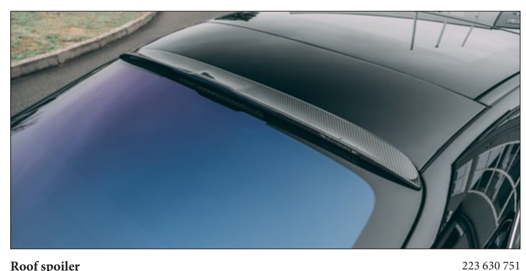
Roof spoiler visible carbon fibre primed without clear coat