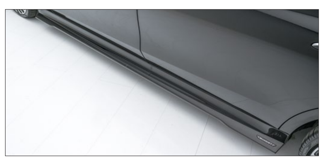
Side skirts lip, visible carbon - long version

visible carbon fibre without clear coat air intakes, 3 parts set