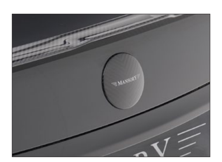
Rear hatch emblem visible carbon fibre glossy*