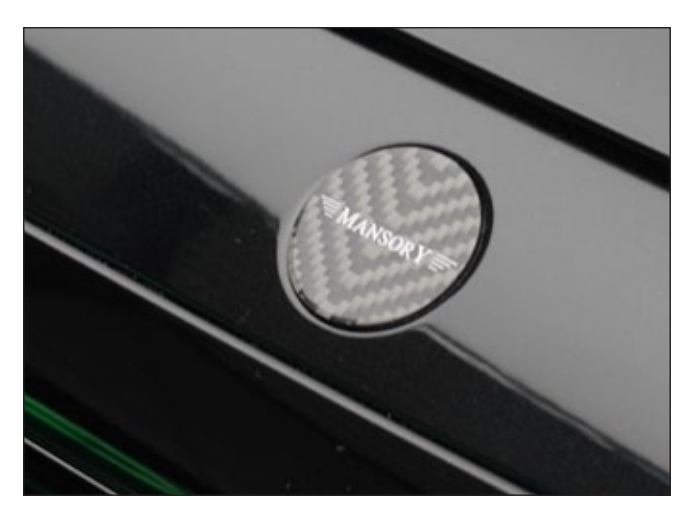
Front bumper emblem with logo