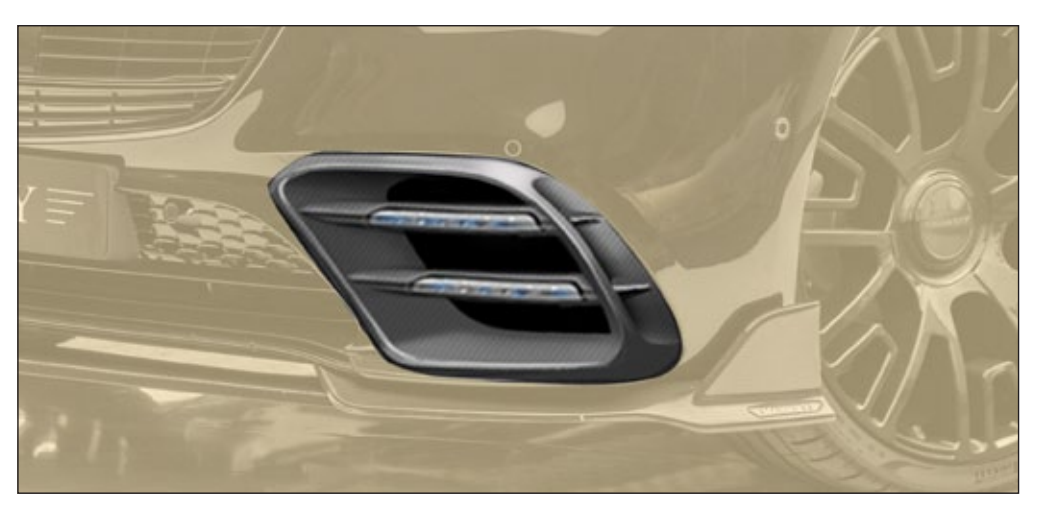
Front bumper air intake with double DRL

visible carbon fibre without clear coat air intakes, 2 parts set - left & right