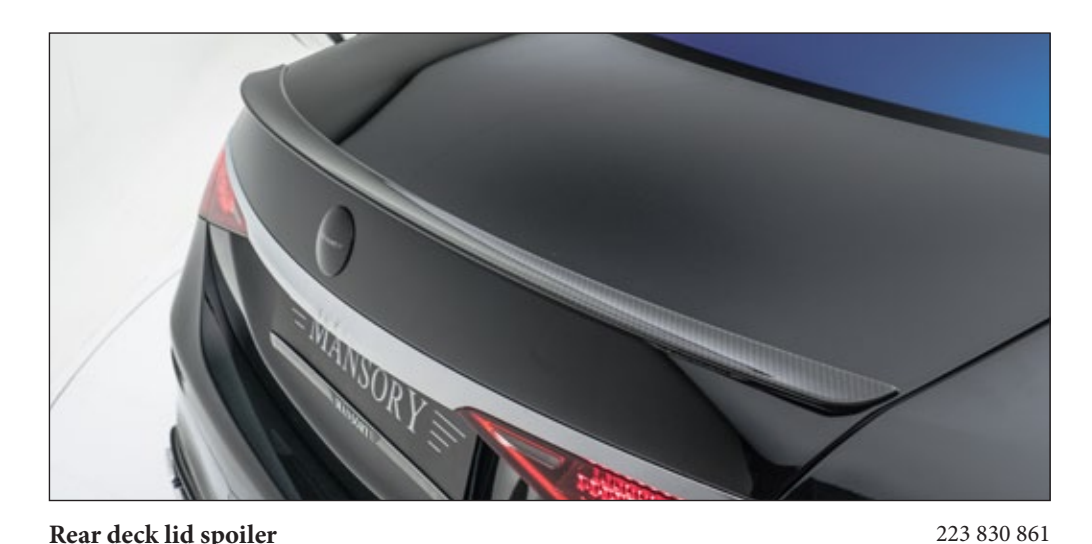
Rear deck lid spoiler visible carbon fibre primed without clear coat