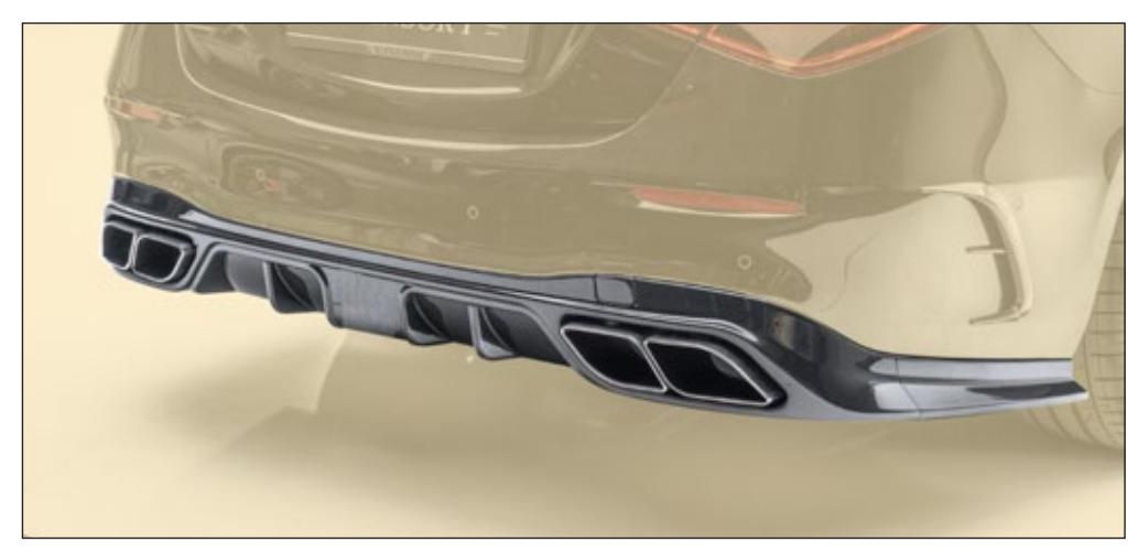
Rear diffuser visible carbon fibre without clear coat,