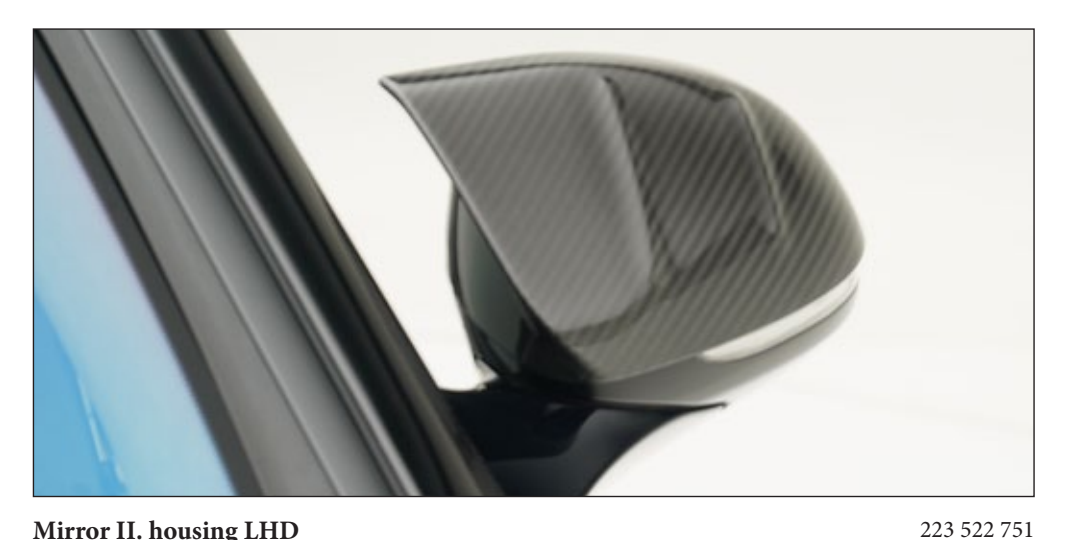
Mirror II. housing LHD 2 parts set - left & right, visible carbon fibre glossy*