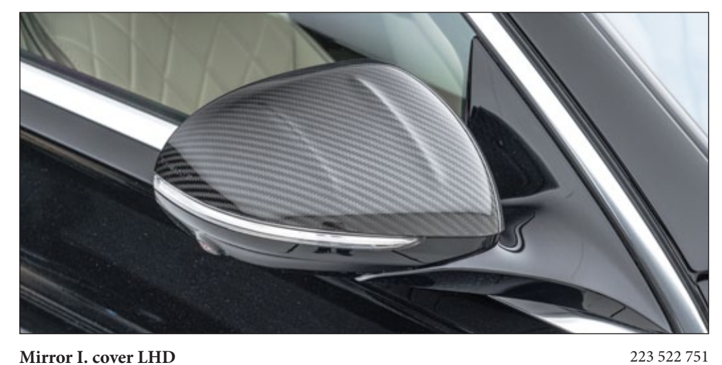
Mirror I. cover LHD 2 parts set - left & right, visible carbon fibre glossy*