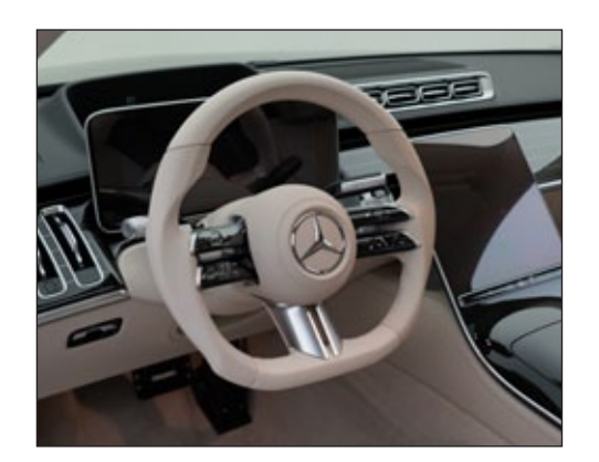
Sport steering wheel