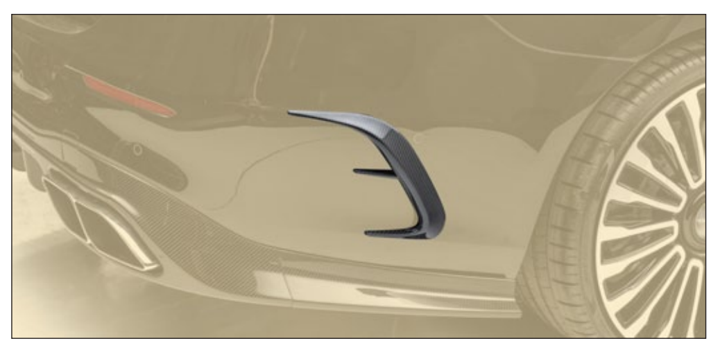
Air outtake splitter for Rear bumper 2 parts set - left & right