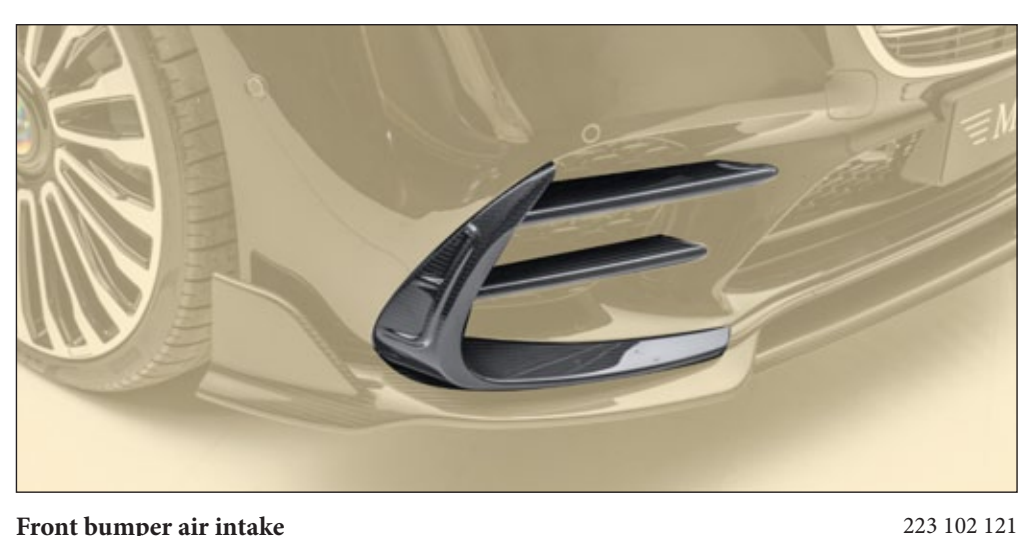
Front bumper air intake

2 parts set - left & right visible carbon fibre primed without clear coat